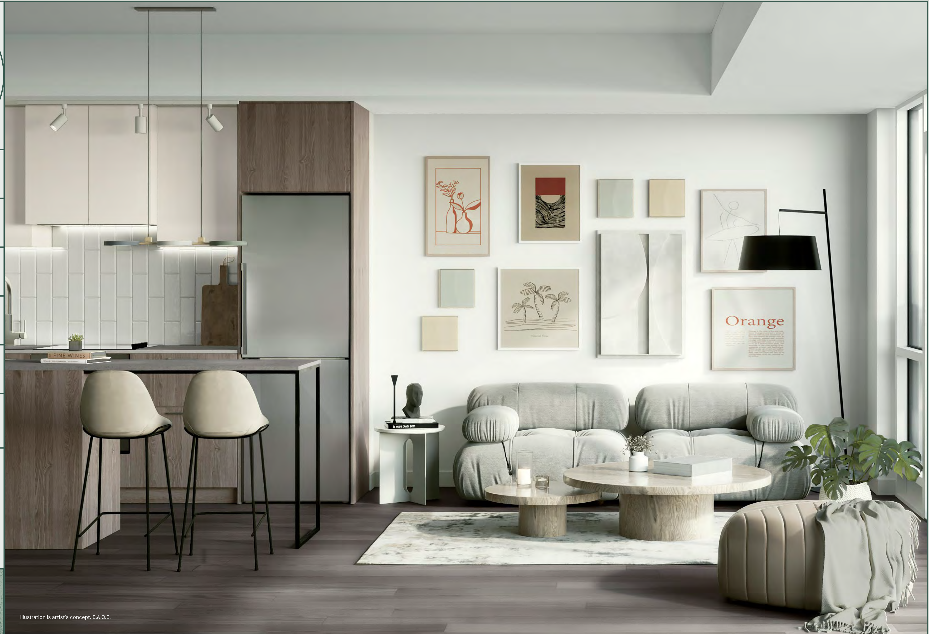
Illustration is artist's concept. E.&O.E.

TOTAL INDOOR & OUTDOOR: OVER 35,000+ SQ. FT.